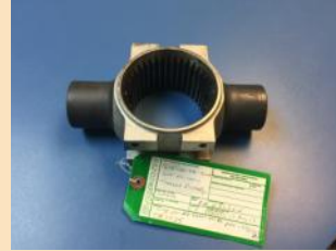
Part # 204-011-105-1. Trunnion. AD 200-01-31 requires that we replace this since we have not yet been able to establish Time In Service for the part.

Every two years, Lancaster Airport puts on a fantastic show. Community Days 2017 on August 26 and 27 this year was no different. We might be biased, but 823 was one of the big attractions at this years show. Lots of folks wanted their pictures taken sitting behind one of the M60 machine guns and our “gunners” did a great job ensuring everyone got in and out safely and was happy with their photos. Passing out brochures, answering questions, and