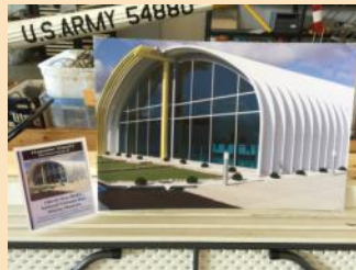
Maybe this is what will come to be called the Chicken Coop? Who knows? Looks like it could be a nice place to hang out someday.

All of our supporters are heroes. Your donations help to ensure that the legacy of service by both the Vietnam veterans and the aircraft that flew them will not be forgotten.