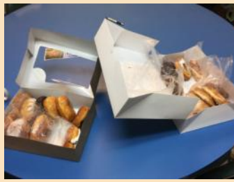
If we don’t get 823 out of the hangar and flying soon, the entire crew will have to be put on a strict diet! Weight and Balance indeed!