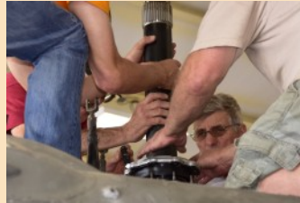
Installing the main rotor mast. It takes a lot of helping hands to get this stuff done. Our volunteers are fantastic! Why not help them succeed by joining us today?

Through the efforts of Project Rooster, we acquired a nice set of main rotor blades (pictured above), with just shy of 1200 hours of time left to fly from Advanced Composite Structures . The project manager on the Rooster project is working with us behind the scenes to help get 823 in the air as soon as possible. What's really exciting is that the Project's task list is far from complete, and suffice it to say, that what were once long-range plans for Liberty