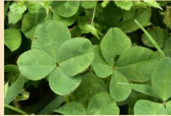
A bunch of four-leaf clovers, just outside the hangar in early June turned out to be very good luck for our efforts to restore Huey 823.