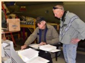
Helping Vets get to a safer place!